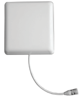
Outdoor Panel Antenna