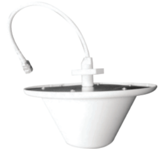
Indoor Omni Antenna