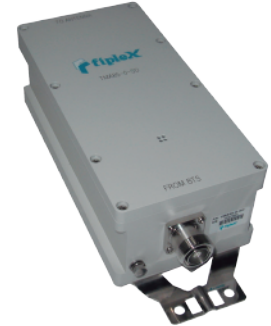
Dual Duplexed Tower Mounted Amplifier 800 MHz band